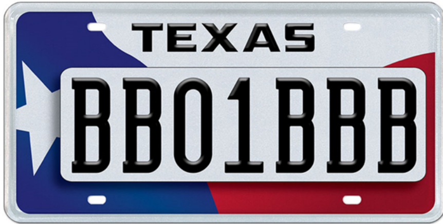
Lone Star Flag

The Lone Star Flag (Regular and Premium Embossed sets) plate are now available on MyPlates.com for purchase.