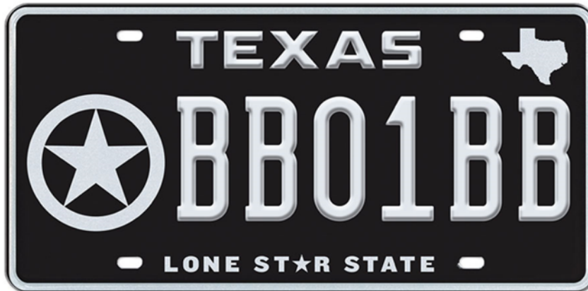
Lone Star Badge Black

The Lone Star Badge Black (Regular and Premium Embossed sets) plate are now available on MyPlates.com for purchase.